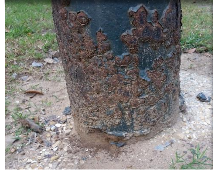
Corrosion on base of poles

What: Due to corrosion, 15 of the St. Charles Streetcar’s Overhead Catenary System (OCS) poles must be replaced. For the safety of RTA passengers, operators, and work crews, a portion of the St. Charles Streetcar line will be closed. The repair work is not expected to affect traffic, and bus service will be provided for this portion of the line.